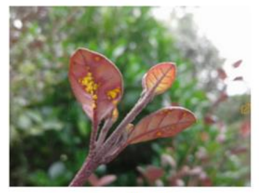
Ramarama with myrtle rust

Ramarama with raised yellow pustules on the leaves and stem indicating myrtle rust. Ramarama is an endemic species of evergreen myrtle shrub which grows to a height of 8m.