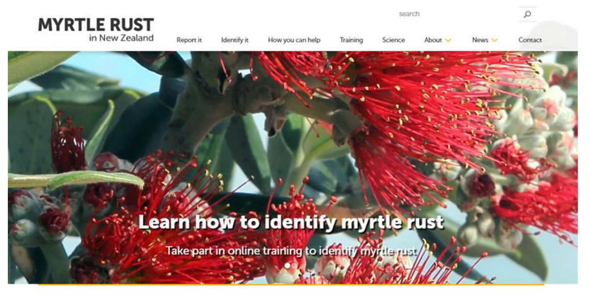
Use this site to find out where myrtle rust is, what it looks like and what you can do if you find it in New Zealand

Some of the pages you can find on the website are shown below.