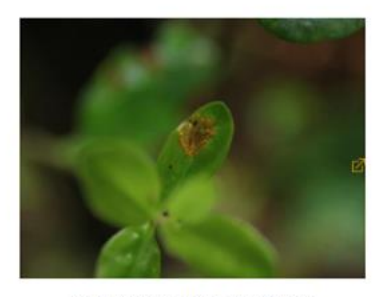
Põhutukawa with myrtle rust

Close up of myrtle rust infection on Kermadec Pöhutukawa. Põhutukawa is New Zealand's Christmas tree, and holds a prominent place in Maori mythology. Although the fortunes of põhutukawa and rata have changed for the better, they are still threatened by people and pests.