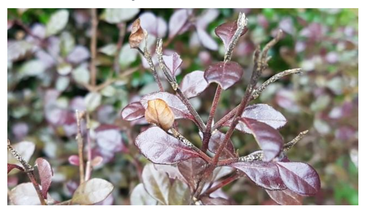
Ramarama with older grey-white pustules on stem and leaves

Be sure to look out for the following this Autumn: