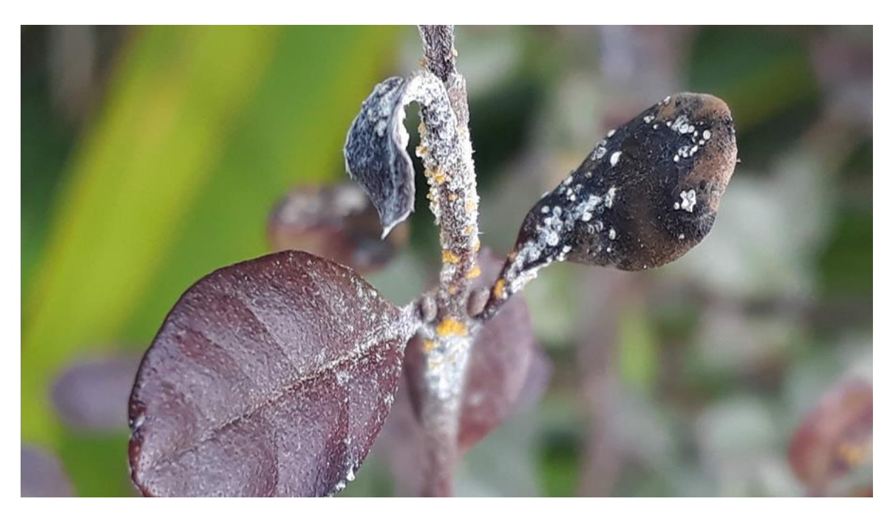
Ramarama with grey-white pustules more common in the cooler months